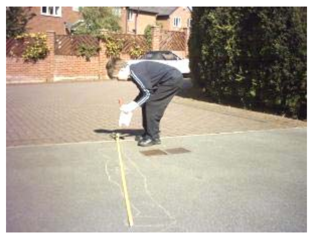
At noon my shadow was shorter and faced North. The sun was in the South.