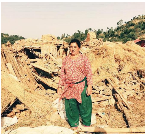
Figure 1 - expression of shock as a teacher is examining destruction of her home which doubled up as SV School in Sagarmatha (Everest) village