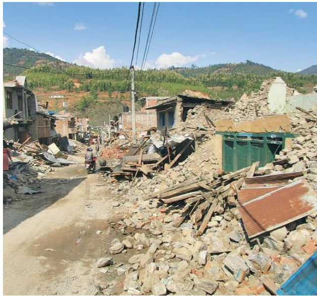
Figure 4 - Village Dhading, another scene of total destruction - school was buried in rubble