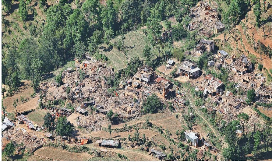
Figure 5 - Tragic scene of near total destruction of Sindhupalchok Village and Saraswati School