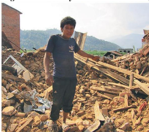
Villager pointing that his daughter is in under this destroyed house